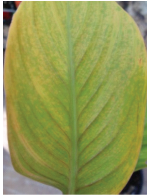
Canna 'Burning Ember'